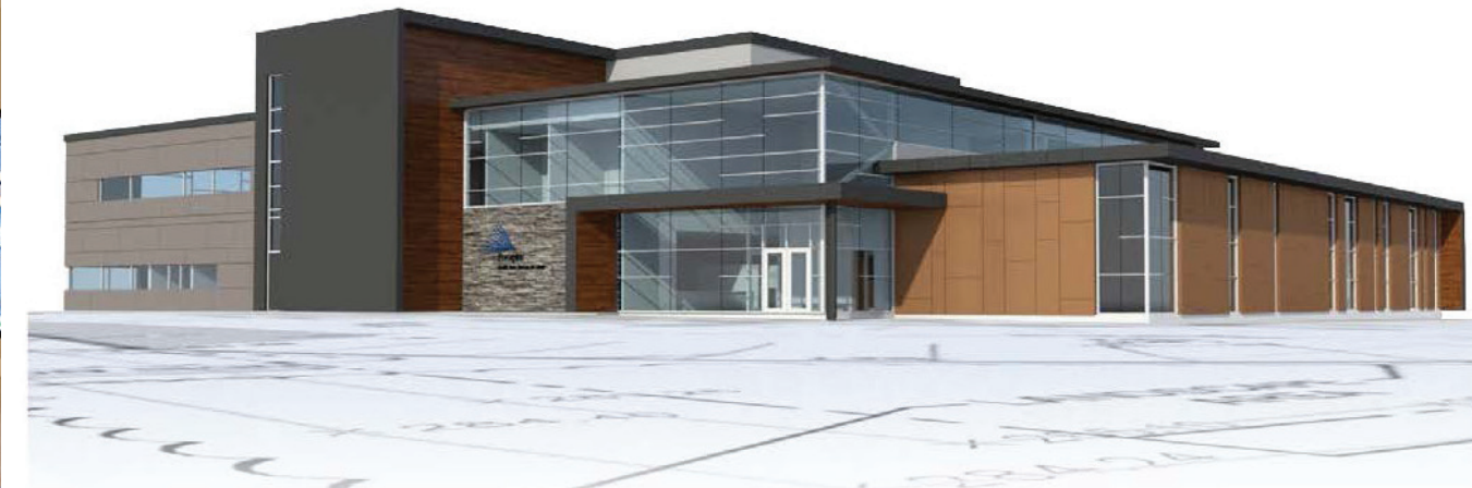
Porcupine Health Unit Administrative Office